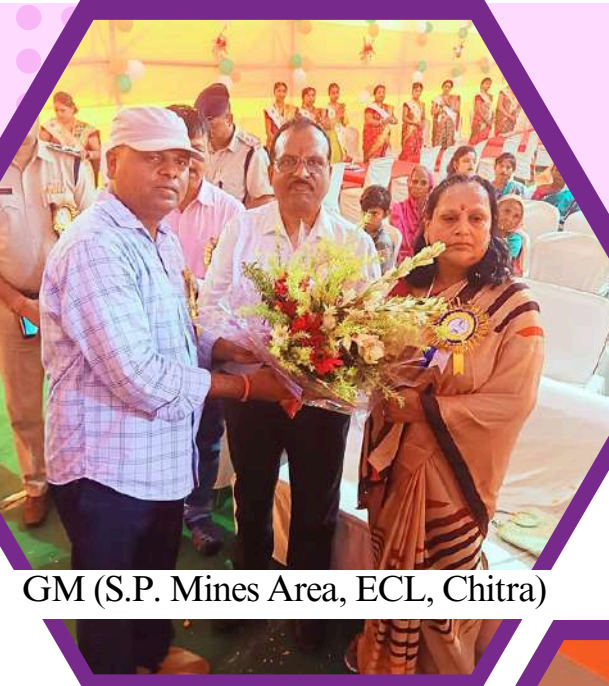
GM (S.P. Mines Area, ECL, Chitra)