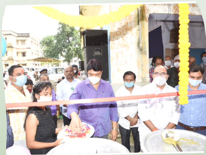
मानव सेवा की मिसाल प्रस्तुत कर रहे श्रील के सदस्यगण - उपायुक्त