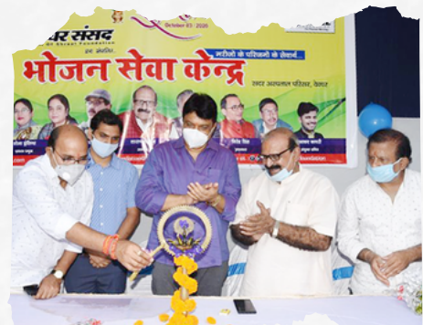
श्रील द्वारा पीड़ितों की सेवा नारायण सेवा तुल्य - विधायक